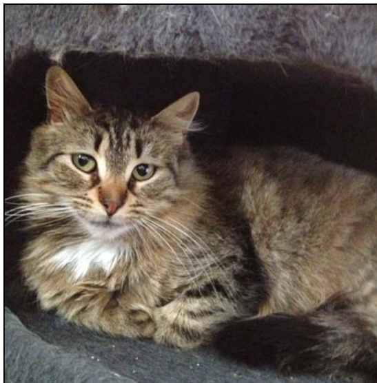
Abby (Mother) Maine Coon – Born: Dec 2011