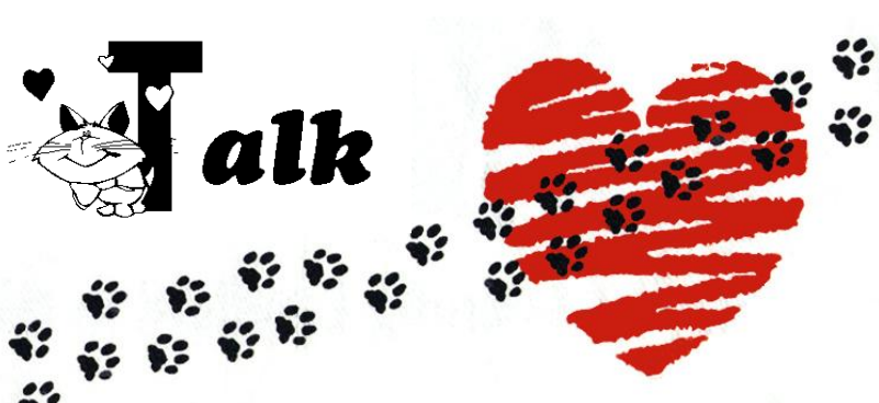
Edition 11-Nov 2014 Beamsville 4Paw Rescue Monthly Newsletter