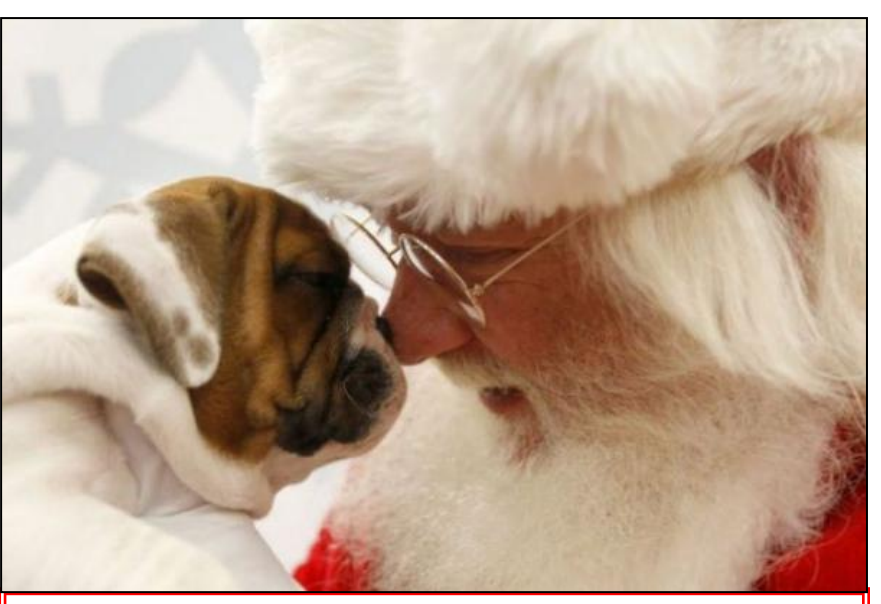
COME JOIN US AT PETVALU ON NOVEMBER 22ND