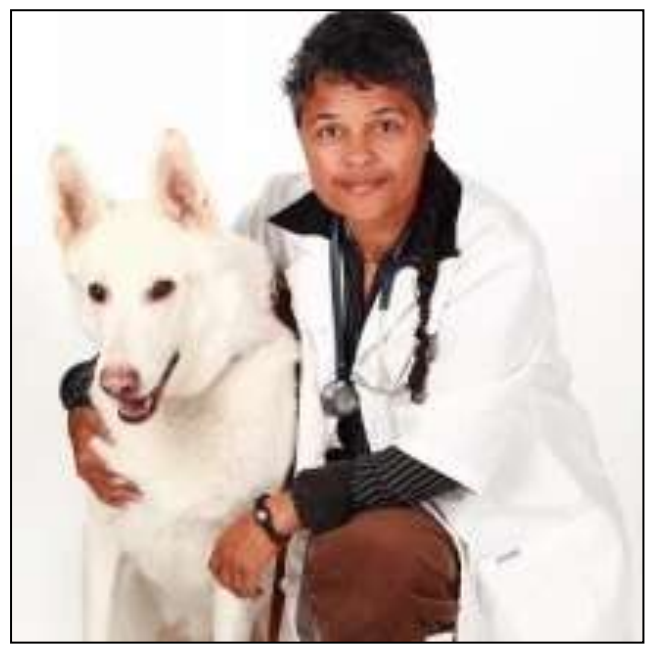
Livingston's goal is to improve the total quality of life for your pets.

Over the years, Livingston has strived to provide the best preventative care for your family pet. Do not miss out on this opportunity to gain some valuable information. The speakers we have selected are proven experts in both the traditional and